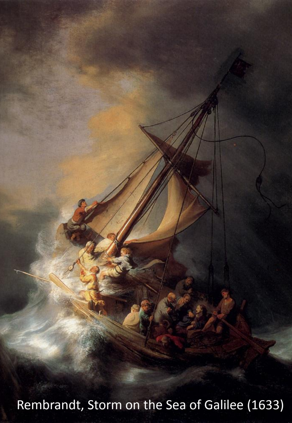
Rembrandt, Storm on the Sea of Galilee (1633)