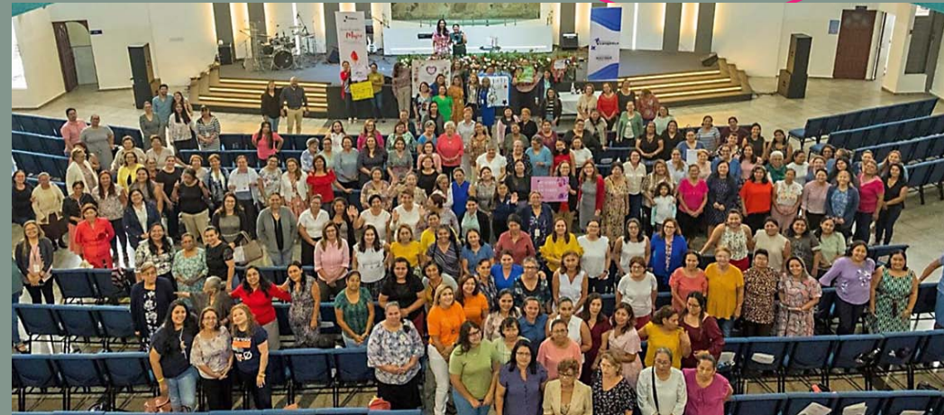
Women in Salvador held a Women's Day on April 20, 2024, with the topic "Confident Christian women in a world in crisis"

Conferences, training materials, a speaker's bureau, research, webinars, growth groups and media representation comprise the expanding strategic activities of the Women's Commission.