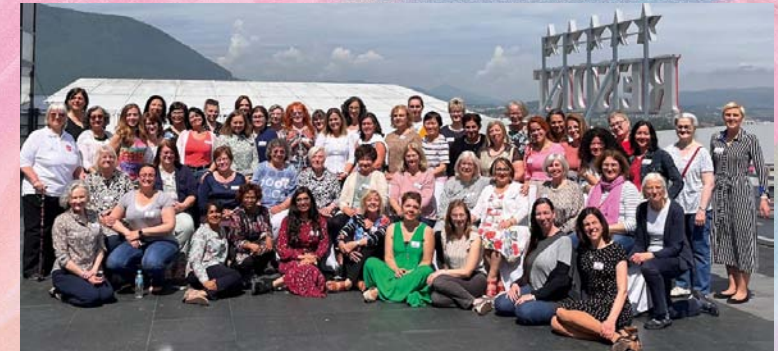
The participants of the 2023 conference in Sarajevo/Bosnia Herzegovina (Balkan)

Our HfE-WiL Team in 2022. Actual we have 11 team-members from 8 different European countries: 3 from Germany, 2 from Serbia, 2 from Romania, 1 from Latvia, 1 from Finland, 1 from France, 1 from The Netherlands, and 1 from the UK.